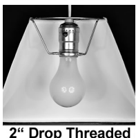
2" Drop Threaded UNO